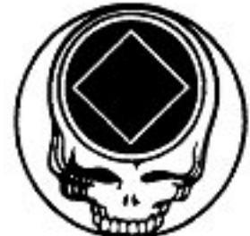
Save Your Face