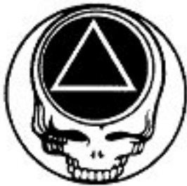
Save Your Face